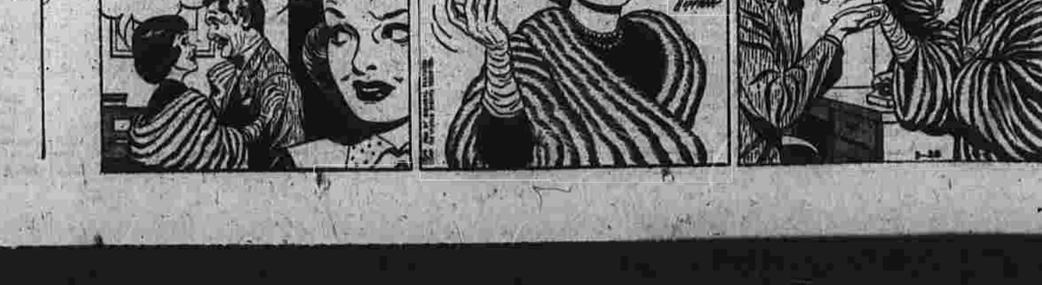
THE BABY HAS BEEN NAMED...